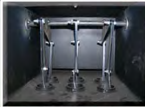
TUBULATOR ROCKER ARMS

Setting the standard higher... to deliver more.