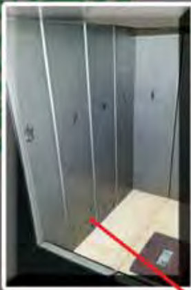
COMPLETELY LINED WITH REMOVABLE AIR CURTAIN PANELS