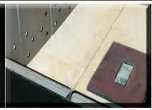
REFRACTORY DRY BASE FIRE BOX