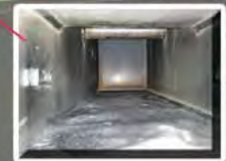
COMBUSTION AIR DAMPER