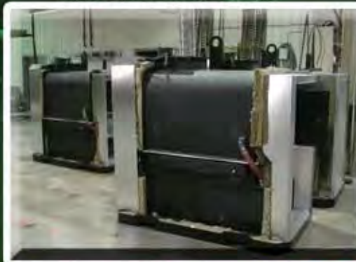
HEAVY DUTY CONSTRUCTION