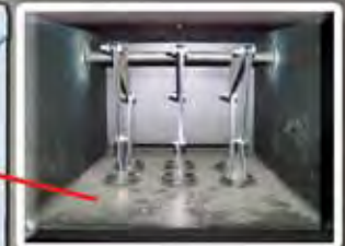
MANUAL ROCKER TUBULATORS