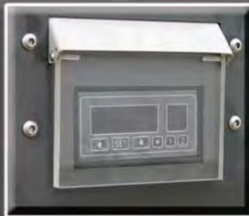
SIMPLE TO USE DIGITAL LED CONTROL PANEL