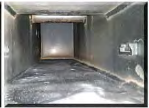
TUBULATOR CLEANOUT PORT