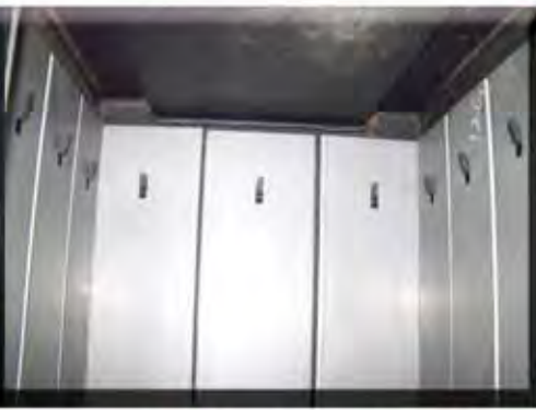
MILD STEEL REMOVABLE AIR CURTAINS