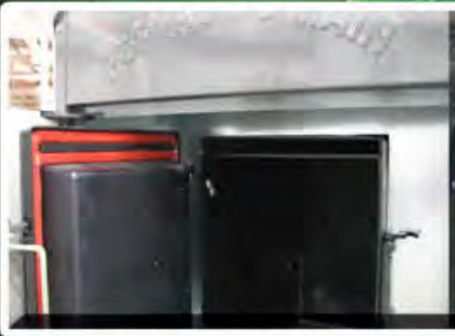
SOLID CORE SILICONE DOOR GASKETS