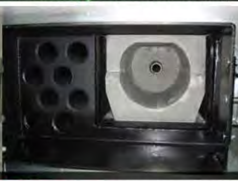
HORIZ & VERT HEAT TRANSFER TUBES