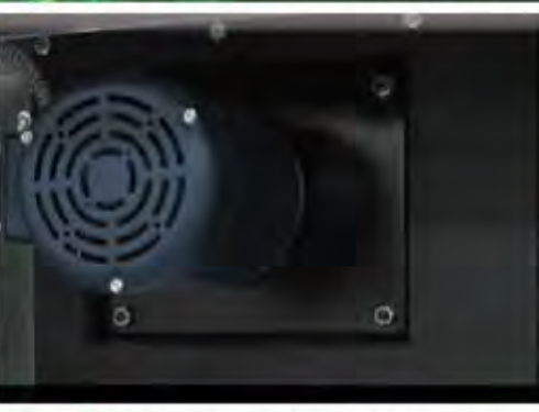
HEAVY DUTY LEESON ELECTRIC MOTOR