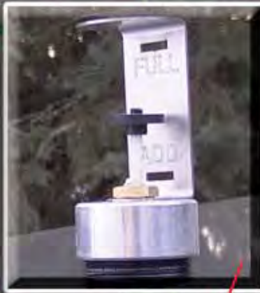
EASY TO SEE WATER LEVEL INDICATOR AND BLOW OFF