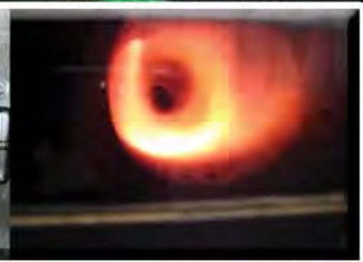
VOXTEX REFRACTORY FIRE CHAMBER